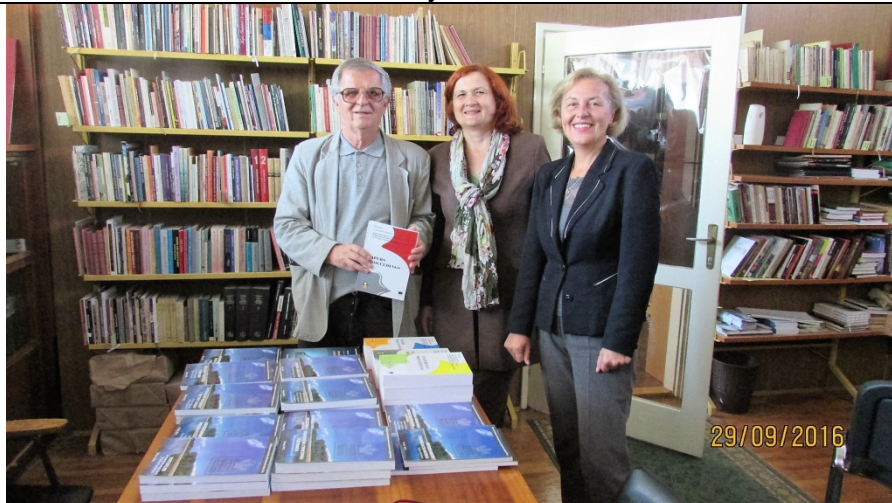
Handover of Published textbooks and teaching materials within II cycles of printed textbooks in The National Library in Užice

At this way all Published textbooks and teaching materials are permanently available to public – customers of The National Library services.